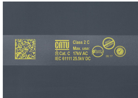
Detail of marking

Protective equipment against electric shock.